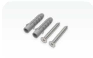
K-47 fastening set