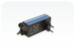
24 V 1.5 A power adapter