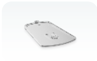
Base leg and pads