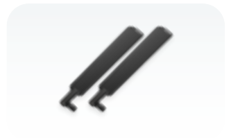
HGO indoor antenna kit